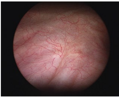
Normal Bladder at Cystoscopy

If you would like more information about the specific level of risk, speak with your doctor or anesthetist who can provide you with more detailed information.